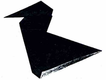
Origami (Paper Folding) - Hisako Chrismore