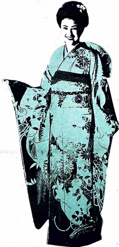
Costumes - JASI*