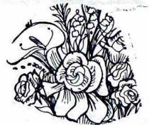
Ikibana - Hiroko Sogi Japanese Flower Arranging