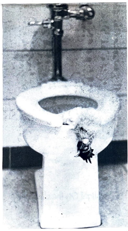
A DEAD chicken, allegedly owned by a commercial Art student, was found in a men's restroom in Bldg. 24, shortly after Halloween festivities. The cause of death is still under investigation.

Office Education Association of the Secretarial Department is now selling candy bars in Bldg. 25. Profits will go for the expenses of persons competing at state and national levels for honors.