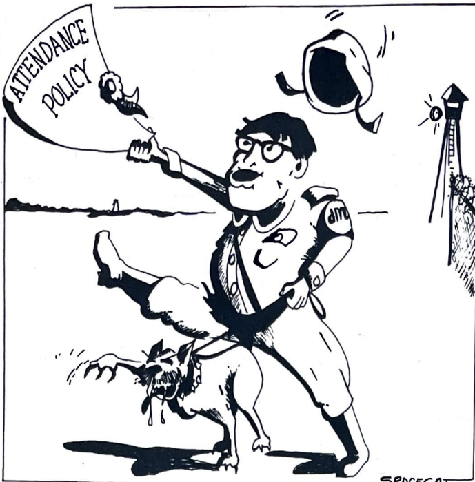
A FEW QUESTIONS ???

The return of responsibility of attendance to the student has brought a lowering of student suspensions. The current policy for General and Career Education, of instructor discretion does raise a few questions. As the Student Handbook says "the instructor is in the best position to judge the effect of the absence on the students progress". Progress in what direction? The ability to memorize the contents of a text book does not constitute the ability to use this knowledge effectively in society. Many students although only attending class occasionally have the ability to maintain a passing grade. The judgement of the instructor to suspend a student automatically means loss of credit hours, loss of tuition, and loss of time in the quarter.