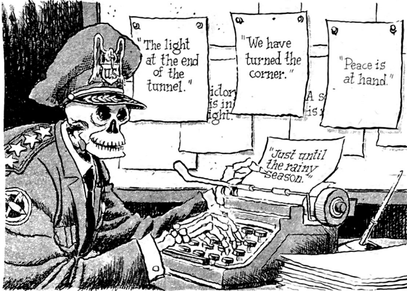
"I GOT A MILLION OF 'EM!"